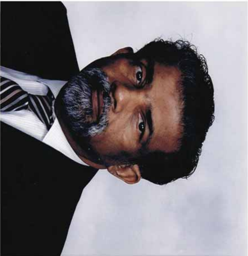
E. C. G. Sudarshan (1931–2018)

Prof. E.C. G. Sudarshan passed on in May 1918 at the age of 88.