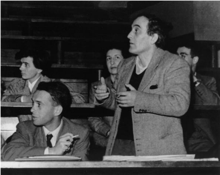
Figure 3 Beppo Occhialini talking in favor of the G-stack exposure at the Pisa Conference.

The G-stack was launched over Northern Italy, near Genova, six months after the Padova Conference. Because of the heavy weight of the package and the huge cost of the emulsion block, it was decided to make a single launch, and to hope for good