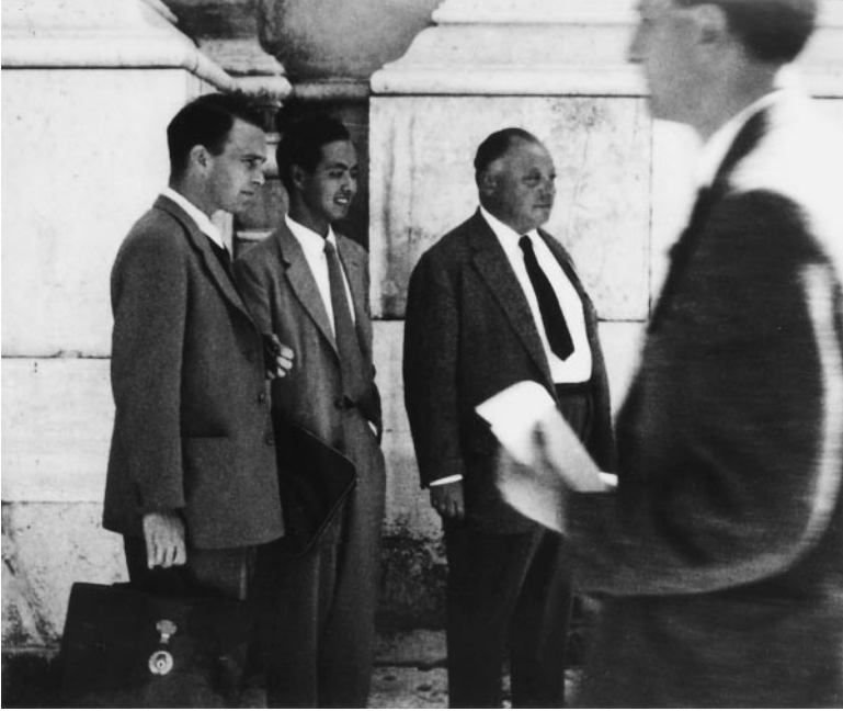
Figure 5 The Padova-Venice Conference in 1957. A rest in the area of the San Giorgio isle in Venice. From left to right: B. Touschek, T.D. Lee, W. Pauli, and R. Marshak.

storage rings is well-recognized, proposed that a suitable gauge transformation of the neutrino field, imposed to keep m_\nu = 0 , leads to two-component neutrinos; moreover, he elaborated on the equivalence of two-component and Majorana neutrinos. A.H. Rosenfeld, G.F. Chew, M. Lévy, S. Fubini, and many others discussed the nucleon-nucleon and nucleon-antinucleon forces and pion physics. Here the nucleon itself was becoming an important object of investigation after Hofstadter's recent results. Moreover, some fresh approaches were presented by W. Heisenberg, N. Dallaporta, L. Okun, and others toward models where hadrons are composite particles, foreseeing new symmetries and quarks. "And small fleas have smaller ones, and so ad infinitum"?