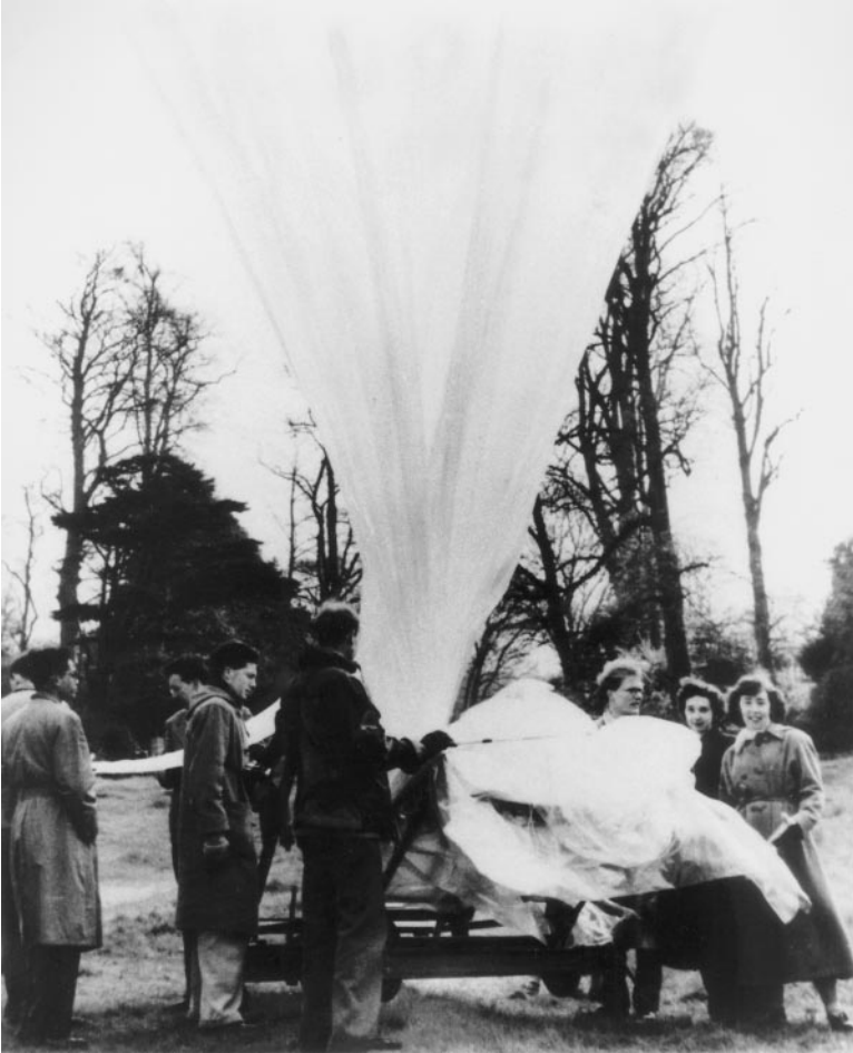
Figure 1 A balloon ready for the ascent in the Sardinia area in July 1953. For the first time, emulsion stacks were made up of 40 stripped emulsions bound together between thick glass plates, wrapped and sealed and subsequently marked with X-rays.

microscopic scanning. These launchings, with balloon fabrication concentrated at Bristol and Padova but the responsibility of preparation divided among many laboratories, were soon organized. Figure 1 shows a launch demonstration. Cagliari, in Sardinia, was chosen as the launch site. The balloons floated at constant height for some hours, after having reached an adequate altitude (between 20 and 30 km), and the emulsion loads were then liberated and dropped down with a parachute on the sea, where a ship was ready to recover them. About half were successfully recovered. The collaboration involved a large number of European universities, 22 laboratories from 12 countries.