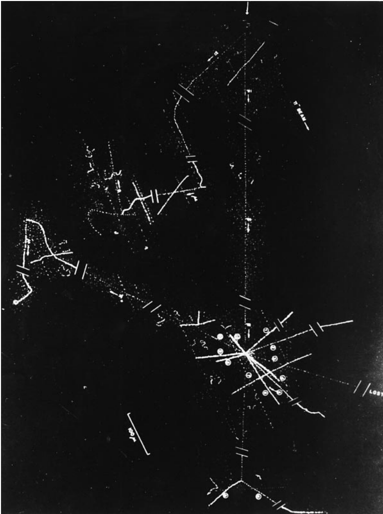
Figure 4 A drawing of the \bar{\Lambda}^0 event. (From Reference (27) with permission.)

At the Venice Conference, on the weak-interaction side, a great deal of attention was given to parity nonconservation searches, and Jack Steinberger presented evidence for parity nonconservation in \Lambda^0 decay, which had been detected for the first time in purely hadronic interactions.