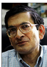
P Balaram is the Director, Indian Institute of Science, Bangalore

This account is based on editorials in Current Science (Jan 10, May 10 and December 25, 2008) and a Foreword for the publication IISc – Profile 2008–2009 , Indian Institute of Science.