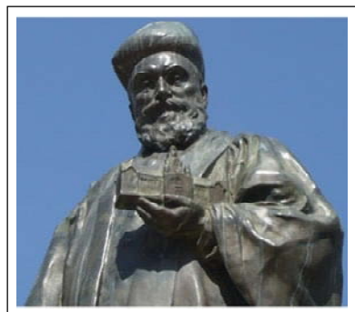
Figure 1. Statue of Jamsetji Nusserwanji Tata unveiled at the Indian Institute of Science on March 10, 1922.