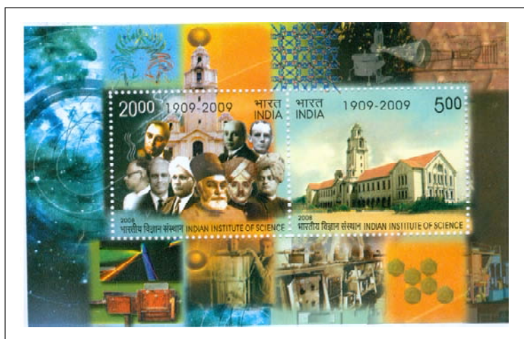
Figure 3. Commemorative postage stamps issued in December 2008.