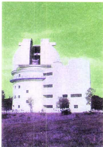
Vainu Bappu Telescope Building Kavalur