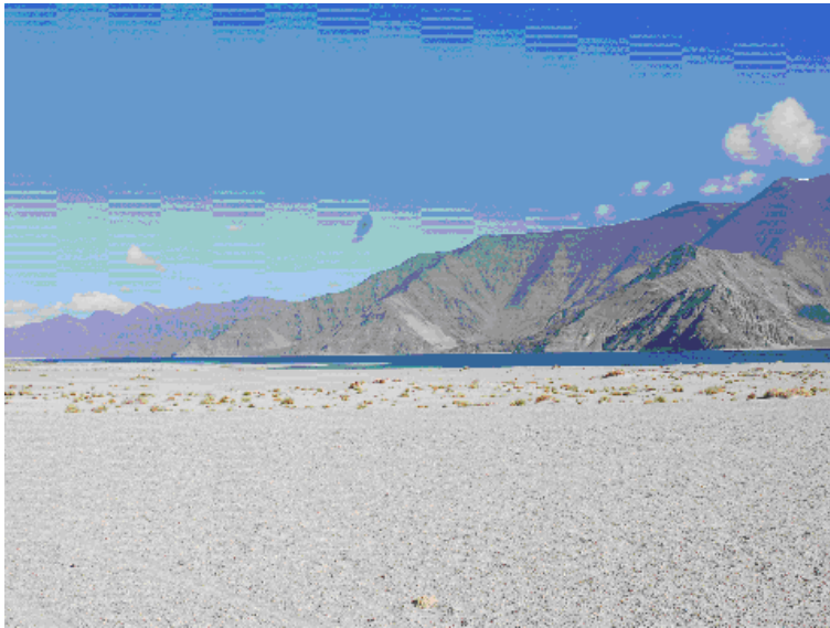
Figure 2. Part of the Pangong lake in the Himalayan region.

places has indicated that the lake sites provide better seeing conditions such as that at Big Bear Solar Observatory. We, therefore, have planned to determine the atmospheric conditions during daytime at Hanle (existing observatory), Pangong in the Himalayan region (a big lake site, Fig. 2) and Devasthal near Nainital Observatory). We have already collected the weather data at Hanle and at Devasthal. We have started to determine the weather conditions at Pangong as shown in Fig. 3. We plan to measure the seeing conditions at these places using S-DIMM and SHABAR techniques. We have already procured one such instrument from National Solar Observatory, USA which we expect to install at Hanle during the period of June 2007. We plan to fabricate such systems to measure the seeing conditions at other places mentioned above and at some other places chosen later.