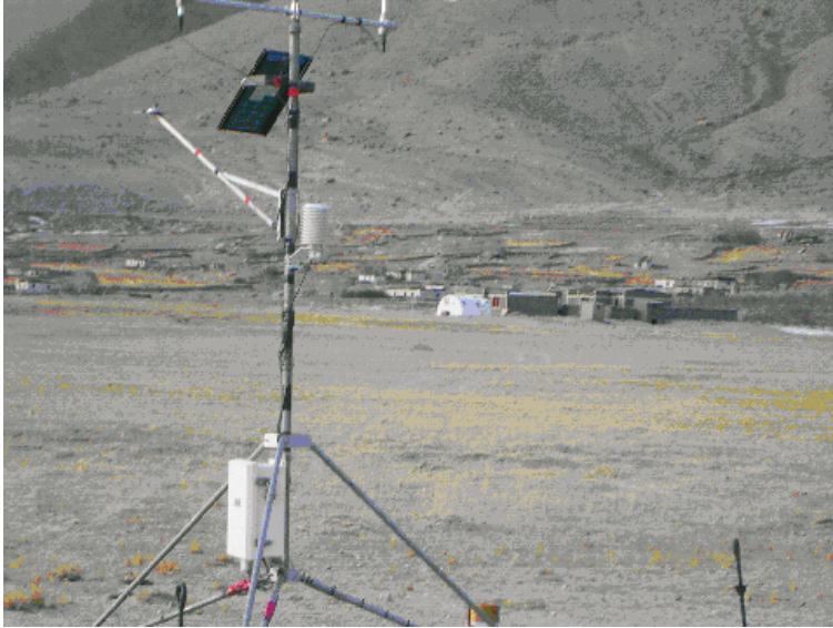
Figure 3. Weather station at Pangong to measure solar radiations, temperature, wind speed, etc.