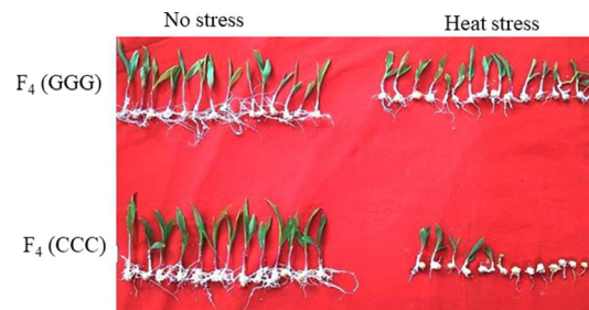
Figure 2. Effect of heat stress on seedlings of F 4 (CCC) and F 4 (GGG) progenies of maize. GGG, F 4 progenies derived from pollen selection in F 1 , F 2 and F 3 the generations; CCC, F 4 progenies derived without any pollen selection in F 1 , F 2 and F 3 the generations.

The contrasting F 4 progenies, namely GGG (pollen selection in F 1 , F 2 and F 3 for heat tolerance) and CCC (no pollen selection) were compared for heat tolerance at seedling stage. High temperature stress tolerance at seedling stage can be measured using temperature induction response