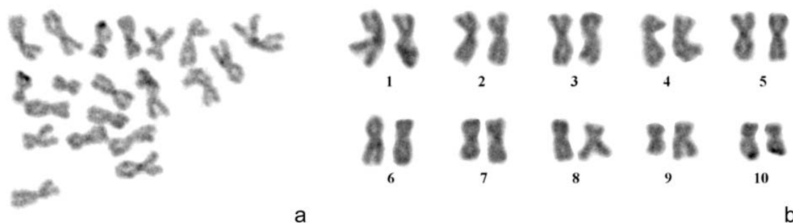
Figure 2. C-banding (CBP, C-banding with barium hydroxide and stained with propidium iodide) in chromosomes of Crassostrea gigas . (a) A metaphase cell (hybridized previously with (TA) 10 probe - figure 1,e), and (b) its corresponding karyotype. Scale bar = 7 \mu m (only for the metaphase cell picture).

All probes used in the present study generated signals on all metaphase chromosomes. The strong hybridization signals observed at distinct locations along the chromosomes probably represent regions where SSRs are included within larger, tandemly repeat units or where SSRs are present as very large perfect or degenerate arrays. Thus, the