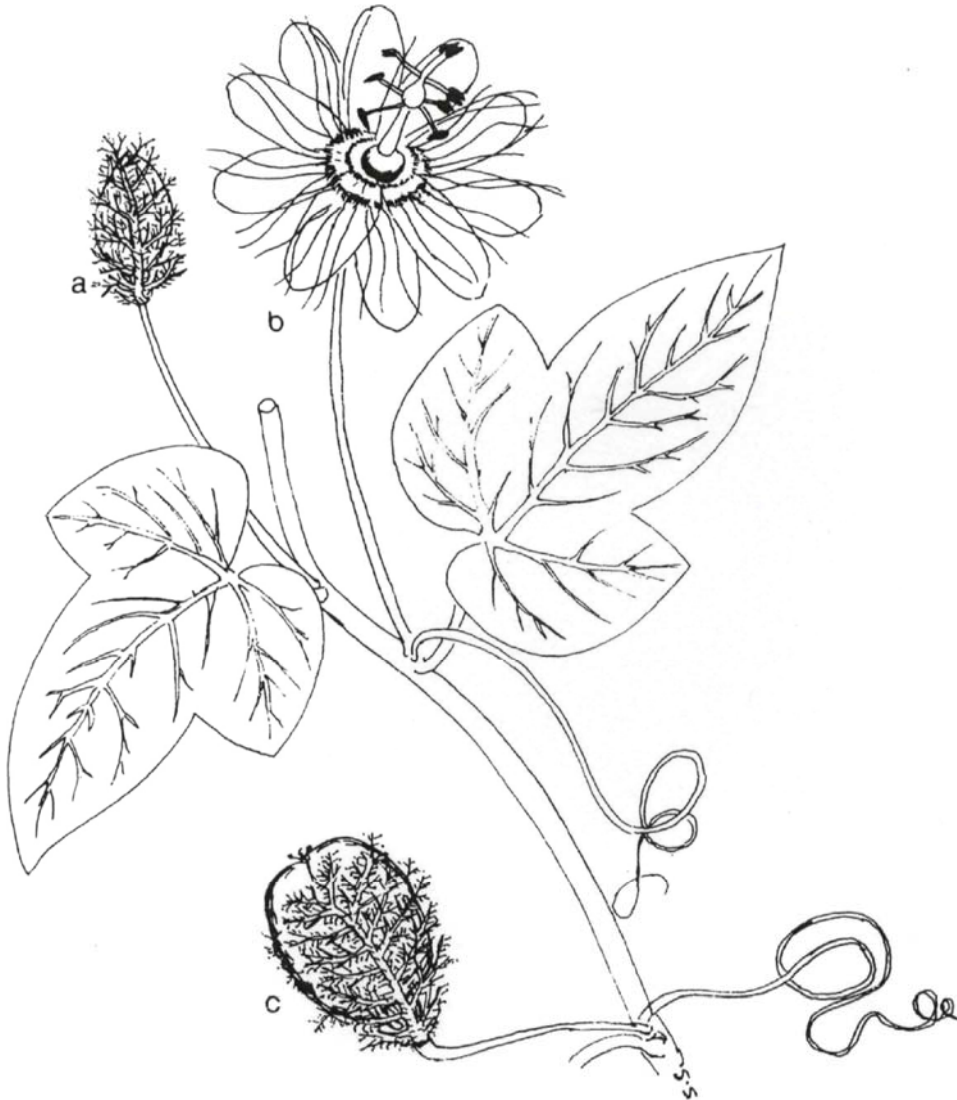
Figure 1. Diagrammatic representation of habit of P. foetida . (a), unopened flower bud covered by bracts; (b), opened flower; (c), developing fruit covered by bracts.

cordate leaf and flower bud at every node. Each flower bud is covered by three highly reticulate green bracts (figure 1). Veins of the bracts end with tiny glandular structures which secrete adhesive ooze. Small insects are found stuck to these bracts. While the bracts completely cover the unopened buds and developing fruits, the open flowers which last for a day, are uncovered ensuring the free movement of pollinators (figure 1). We tested whether bracts of P. foetida impart protection from predators to the developing bud/fruits and possess the necessary machinery to digest insects and absorb aminoacids.