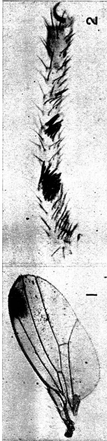
Figures 1 and 2. 1. Wing of male showing black patch. 2. Fore leg of male showing sex-combs.