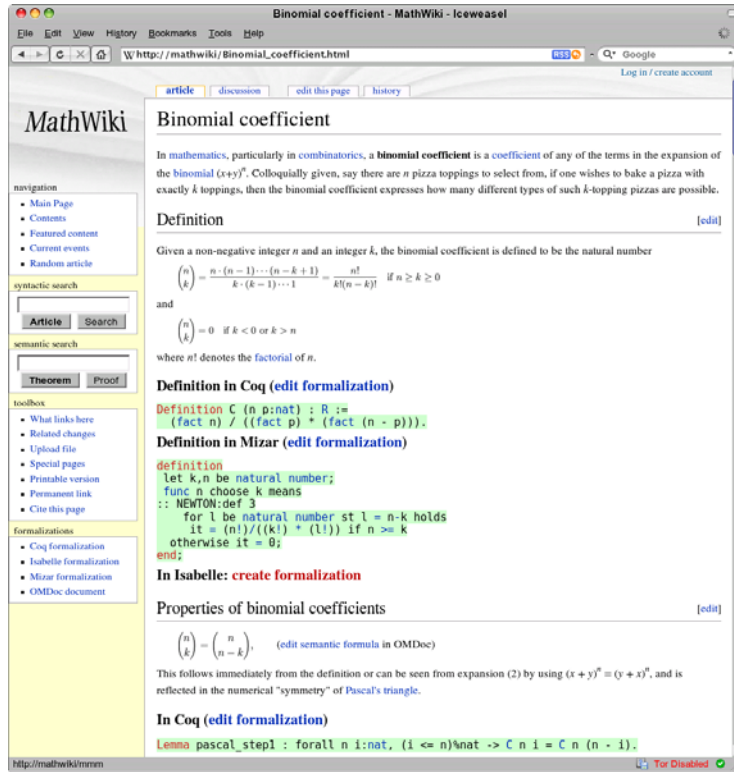
Figure 2. A MathWiki mock up page.

proof assistant itself—although it is an interesting challenge to maintain the consistency of a large online formal repository that is continuously changed and extended through the web. The stability will also have to be ensured by a committee that ensures that the library evolves in a natural and meaningful way.