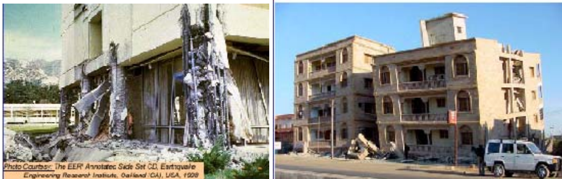
Figure 3. Consequences of open ground storeys in RC frame buildings – severe damage to ground storey columns and building collapses. (left) 1971 San Fernando Earthquake. (right) 2001 Bhuj earthquake.

Open ground storey buildings are inherently poor systems with sudden drop in stiffness and strength in the ground storey. In the current practice, stiff masonry walls (Figure 4a) are neglected and only bare frames are considered in design calculations (Figure 4b). Thus, the inverted pendulum effect is not captured in design.