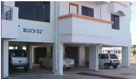
Figure 1. Ground storeys of reinforced concrete buildings are left open to facilitate parking – this is common in urban areas in India.

Reinforced concrete (RC) frame buildings are becoming increasingly common in urban India. Many such buildings constructed in recent times have a special feature – the ground storey is left open for the purpose of parking ( Figure 1 ), i.e. , columns in the ground storey do not have any partition walls (of either masonry or RC) between them. Such buildings are often called open ground storey buildings or buildings on stilts .