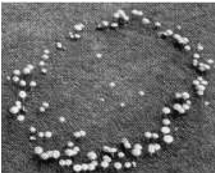
Figure 1. A 'fairy ring' of a mushroom fungus, Armillaria bulbosa . The centripetal growth of the subterranean mycelium has produced a ring of fruit bodies.

Ascomycetes include all fungi that produce sexual spores, ascospores, in a sac-like cell, ascus. For example, Yeast , Podospora , Neurospora , etc.