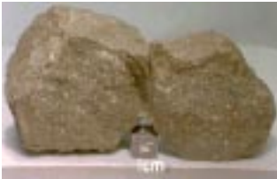
Figure 1. a) Chondrite Meteorite: This meteorite was collected from the Allan Hills in Antarctica. This meteorite is of a type named chondrite and is thought to have formed at the same time as the planets in the solar nebula, about 4.55 billion years ago.

Iron meteorites consist mainly of a solid solution of nickel and