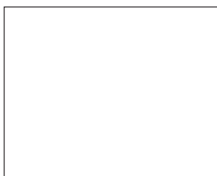
Figure 2 A dhole defending its kill from vultures. A total of 5 dholes killed this chital stag in the Kanha National Park, Madhya Pradesh.