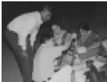
Participants weighing a bat

The participants were divided into four groups for conducting experiments and field studies. The experiments include circadian rhythms in the field mouse Mus booduga , electroretinogram of an insect, rectal temperature rhythm of human, and mark-recapture study. Field studies included visiting caves and observing out-flying bats using bat detector; erecting mist net in the botanical garden, capturing foraging bats and making measurements on them; radio-tracking bats in their foraging area; and recording the echolocation sounds of bats that flew in open space and analysing their characteristics using a software, to find out the frequency and duration of the sounds.