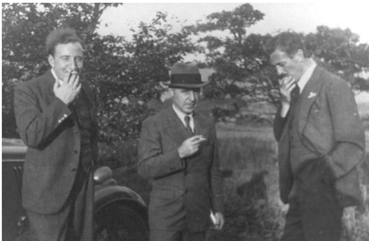
Figure 3. N V Timofeeff Ressonvsky, Herman Muller and Cyril Darlington in Edinburgh in the second half of the 1930s.