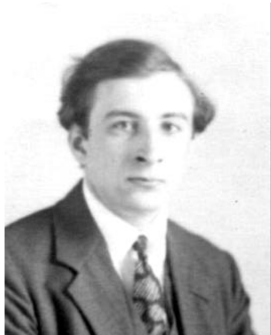
Figure 1. Young N V Timofeeff-Ressovsky in Germany.