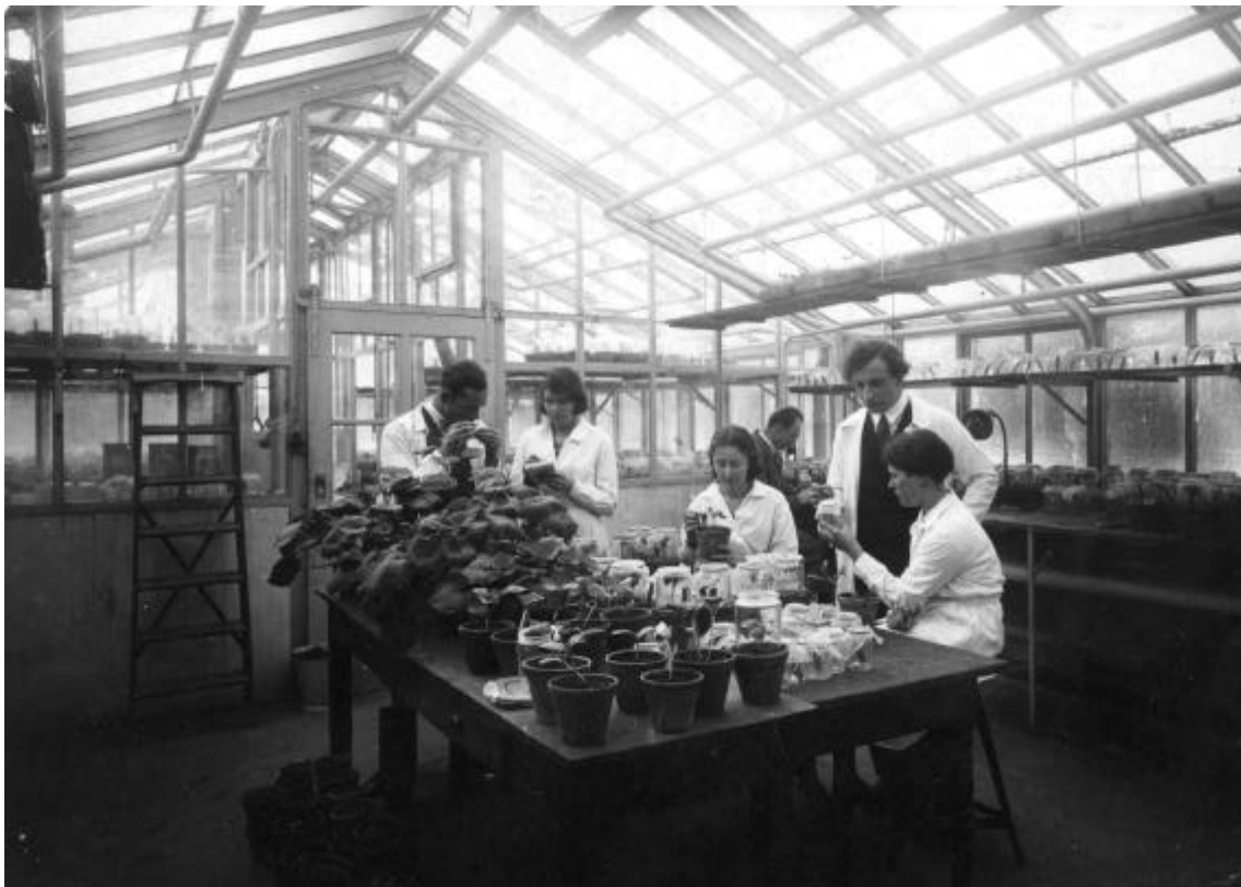
Figure 2. N V Timofeeff-Ressovsky and his co-workers in the greenhouse, Institute of Brain Research, Berlin-Buch, early 1930s.