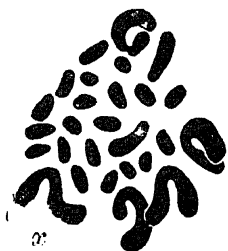
FIG. 4. Mecopola elongata .