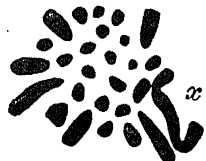
FIG. 2. Elimæa securigera .