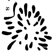
FIG. 7. Hexacentrus mundus .

All are from spermatogonial metaphases, \times 1500 .