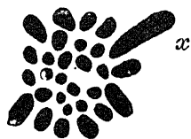
FIG. 1. Ducetia japonica .

the form of a rod. And in the first spermatocyte division this X-chromosome exhibits a