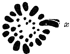
FIG. 3. A species of Phaneropterinx .