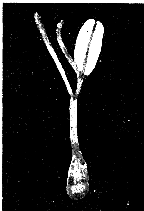
Fig. 1. \times 4 .

ONE of the flowers of Convolvulus pluricaulis Chois. (= Evolvulus pilosus Roxb.) 1 examined during a practical class showed an apparently fertile anther attached to one of the two stigmatic branches of the style (Fig. 1).