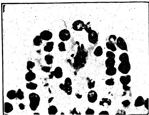
Heterotypic division of the megaspore mother cell. × 1100

The archesporial cell is hypodermal in origin and functions as the megaspore mother cell. The prophase changes in the nucleus of the megaspore mother cell are quite normal. During the heterotypic metaphase a bipolar spindle is formed, but the chromosomes lie irregularly clumped in the centre and their distribution to the poles is very irregular, as shown in the accompanying photomicrograph.