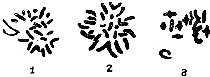
FIG. 1. Spermatogonial metaphase of Liogryllus bimaculatus \times 2270 .

Testes and ovaries of the material were fixed in Flemming's without acetic acid and also in Belling's modification of Navaschin's mixture. The gonads after sectioning were stained in both iodine crystal violet and Feulgen's stain. The chromosome number was found to be 2n=23 in the male and 2n=24 in the female. The complement in the male is composed of (1) an unpaired, metacentric X-chromosome, (2) a pair of V-shaped chromosome and (3) 10 pairs of rod-shaped ones of various sizes (Fig. 1).