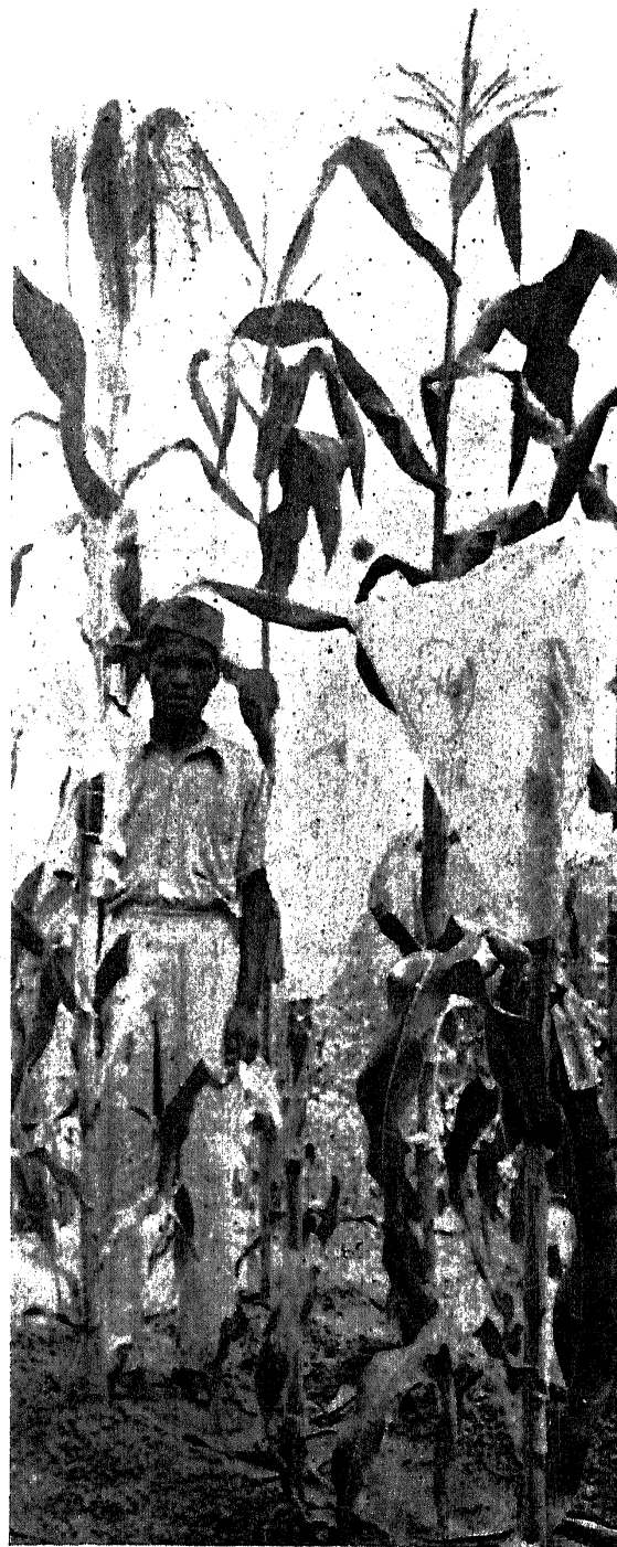
FIG. 1. Photograph of single cross parent plants of Iowa. \times 306 .

giving high yield of double cross hybrid seeds. The photograph, Fig. 1, shows the vigour of the single cross parents of Iowa 306, numbered 5 (AB) and 6 (CD), and a cob of 5 being pollinated by the tassel of 6.