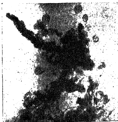
FIG. 1. A cluster of marine species of Vorticella × 115.