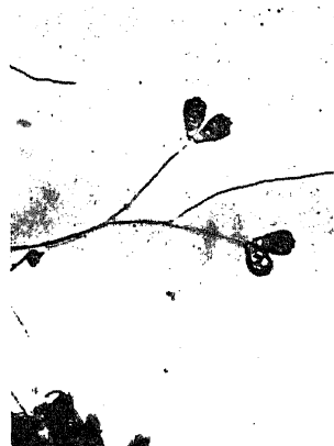
FIG. 2 A colony of Zoothamnium sp. × 115.