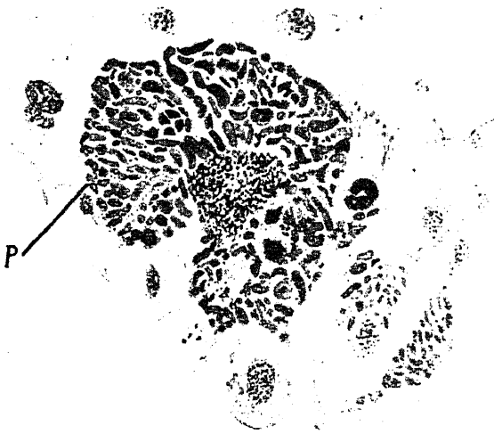
FIG. 3. P. Unknown Cell-inclusion

With regard to the brown tumour it may be pointed out that it is pressed between the chitinous skin and the enveloping red tumour.