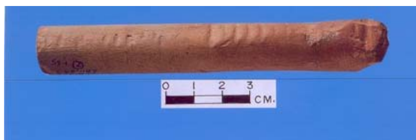
Figure 1. Crude terracotta scale discovered at Kalibangan.

The markings in the Kalibangan scale approach the 17.5 mm standard that is also noticed in the Lothal (ivory) 7 scale. Moreover, the direct connection between this standard unit and the unit in the Mohenjodaro (shell) 8 and Harappan (metal) 9 scales has been established 10 . The major tick mark is indicative of the angulam 4,5 , which is equal to 17.63 mm. On the lower side, each angulam is divided into eight yavas . Most minor tick mark on the Kalibangan scale is equal to one-fourth