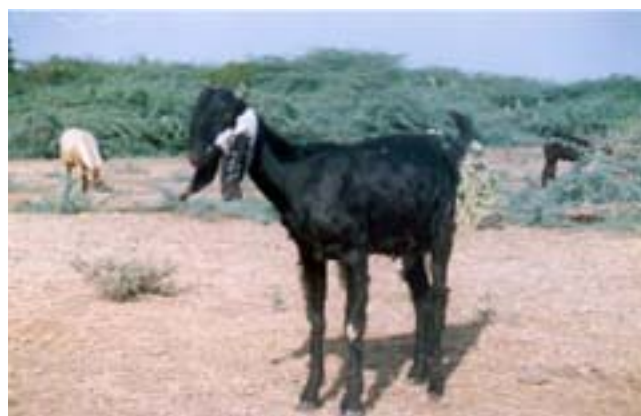
Figure 1. A Kutchi doe in the pasture.

Genomic DNA was isolated from the blood samples using a standard phenol : chloroform extraction method 2 . A battery of 25 heterologous polymorphic microsatellite markers (Table 1) were selected based on the guidelines of the International Society of Animal Genetics (ISAG), and Food and Agriculture Organization's Domestic Animal Diversity Information Service (FAO's DADIS) programme, to generate data in a panel of 46 animals. Most of the primers used were independent and belonged to