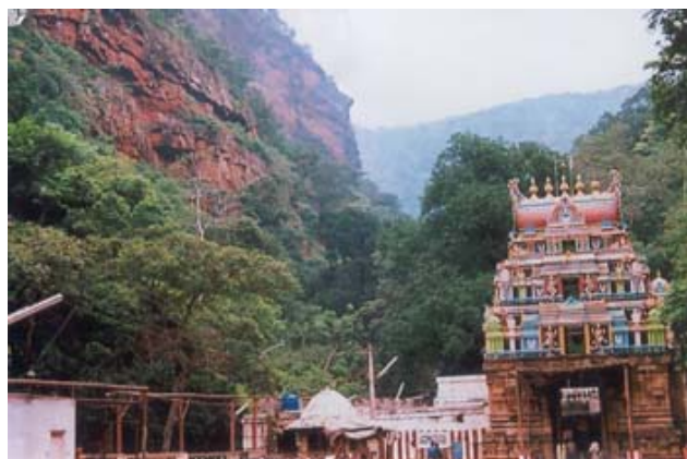
Figure 1. Ahobilam temple amidst the forest.

Thus the Ahobilam forest which is rich in floristic diversity and a treasure trove of rare, endemic, threatened, medicinal and economically useful plants can be