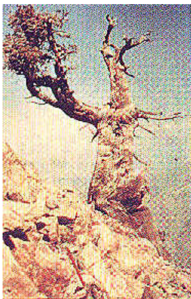
Figure 1. World's oldest growing tree, Pinus longaeva (4600 years) in Eastern California and Nevada, North America.

Tree rings are recorded in many trees growing in different geographical regions due to seasonal activity of cambium. Dating and analyses of tree rings in varied applications are categorized under a specialized branch of science dendrochronology. In the beginning, this science was applied for dating archaeological structures, but now its applications are diverse. Some are: reconstruction of long seasonal to annual climate changes which would help to understand any long-term trend or cyclicity in climatic changes, dating of onset of events which had disastrous impacts in the past (like insect infestations in trees and natural hazards), the assessment of productivity of a forest, dating of glacial fluctuations by studying growth behaviour of trees growing at higher elevations close to snout, analysis of the content of trace elements, such as Hg, Cd, Zn, Cu, Ar in tree rings to get the chronological record of pollution from industrial activities. The criteria in