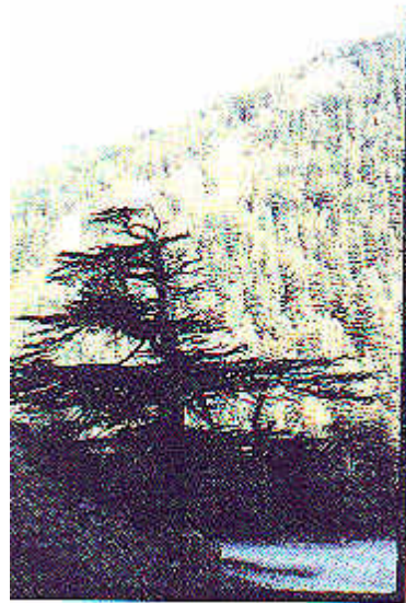
Figure 2. Cedrus deodara , an oldest dated tree in India (745 years), growing in Harshil, Garhwal Himalayas.

Though, in tree ring analysis, the selection of old trees in a region is not an essential criterion, it is desirable for synthesizing long information. World's oldest growing tree, Pinus longaeva attaining age of 4600 years is found on moisture stressed site in Eastern California and Nevada in North