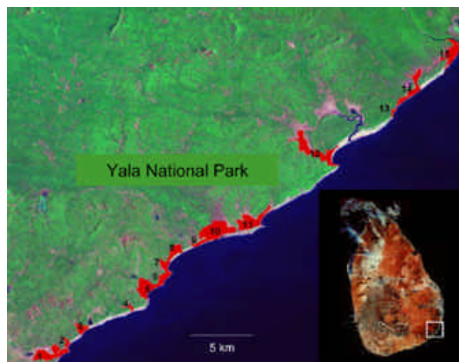
Figure 1. Satellite image of southern Sri Lanka. The area inundated by the tsunami shown in red. The major incursions are numbered. 1, Gode Kalapuwa; 2, Kuda-seelawa; 3, Maha-seelawa; 4, Uraniya; 5, Buttua; 6, Beeri-kalapuwa; 7, Pattanangala; 8, Gonelabba; 9, Kalliya; 10, Yala-wela; 11, Pilinnawa; 12, Pottana; 13, Gajabawa; 14, Gajabaliya and 15, Kumbukkan-oya estuary. (Inset) Map of Sri Lanka with enlarged area marked by white square.

The coastline of Yala National Park impacted by the tsunami was approximately 48 km. It consisted of a series of shallow bays and coastal dunes. Sea incursion by the tsunami occurred where dunes were deficient, as in lagoon or river outlets (Figure 1). Fifteen such major incursions