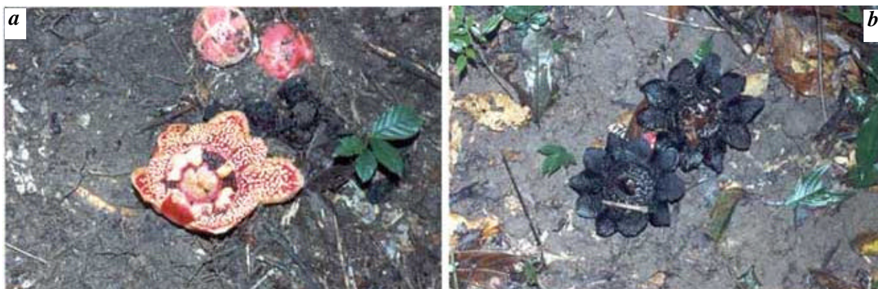
Figure 2. Sapria himalayana in its natural habitat in Namdapha. (a) Live flower and (b) dead flower.

and Tetrastigma serrulatum (Roxb.) Planchon, both belonging to Vitaceae. T. bracteolatum is a wiry and glabrous climber with woody stem. The flowers are whitish and the fruits (berry) are black. The species was found fruiting during the study period. T. serrulatum is also a wiry glabrous climber, but with adhesive tendrils. The flowers are green in colour and the plant was not in fruiting stage (February). Both the hosts are lianas and were found to be common in the distributional range of Sapria . Apart from the host plant, other associated plants growing in the vicinity are Fissistigma polyanthum , Saprosoma tarnatum , Comelina paludosa , Piper sp., Chisocheton paniculatus , Talauma hodgsonii , Dysoxylum binectariferum and Dysoxylum procerum . Earlier, a large population of Sapria was reported from the 40th mile area of the park 7 ; now there is no sign of its existence. However, further long-term observations are needed.