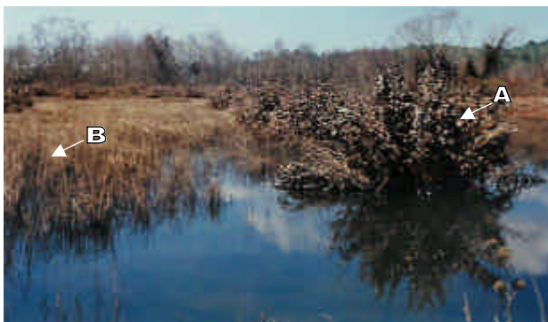
Figure 1. Mangrove associates – Giant fern, Acrostichum aureum (A) and sedge, Fimbristylis littoralis (B) affected by high line water brought about by tidal surge.

Avicennia tree was found to be more tolerant to thrive in the altered condition the tsunami brought due their secretory nature than Rhizophora . Another permanent feature that the earthquake has brought about is that the land mass of the South Andaman has gone down by 1.25 m, that is subduction has taken place. With the result, the mangrove