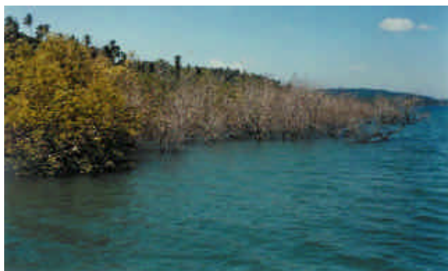
Figure 3. Rhizophora tree affected by continuous inundation due to rise in water level following subduction of land at Minnie Bay, South Andaman.

which remained exposed during normal low tide, now remains deeply submerged throughout the period in some areas.