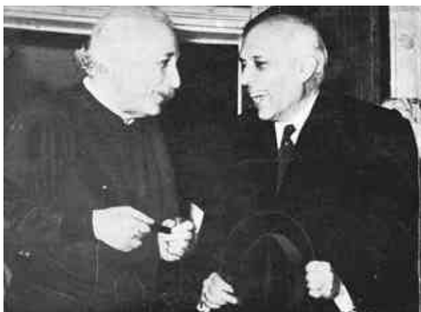
Einstein with Nehru, USA, 1949 (ref. 38).

ing of the glorious intellectual and spiritual tradition of your great country. The analysis you have given in the second part of the book of the tragic influence and forced economic, moral and intellectual decline by the British rule and the vicious exploitation of the Indian people has deeply impressed me. My admiration for Gandhi's and your work for liberation through non-violence and non-cooperation has become even greater than it was already before. The inner struggle to conserve objective understanding despite the pressure of tyranny from the outside and the struggle against becoming inwardly a victim of resentment and hatred may well be unique in world history. I feel deeply grateful to you for having given to me your admirable work.