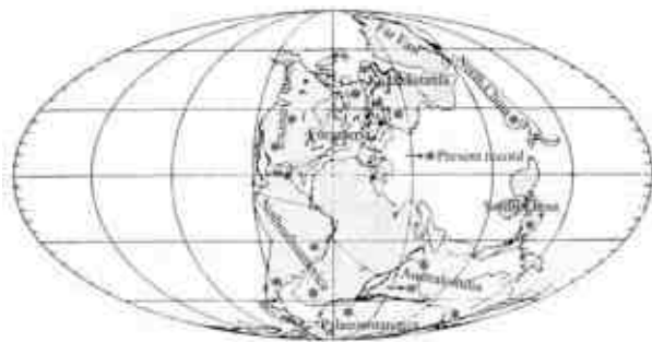
Figure 3. Distribution of Annularia spp. in different floristic provinces during Early Permian (after Cleal and Thomas 14 ).

gent, multi-nerved leaves of Schizoneura Schimp. & Moug. The Mesozoic genus Equisetites Sternb. shows some similarities with our specimen in the alternate arrangement of ridge and furrow and almost free leaf segments, but the number of leaves